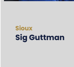
Sioux Sig Guttman